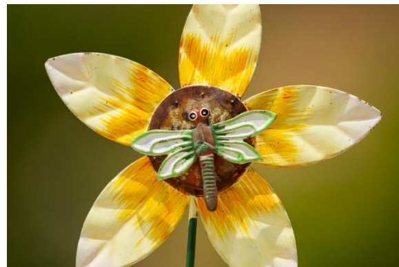
EOS 1D MkIV APS-H (1.3x)