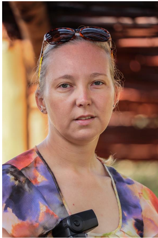
Canon EOS R, 300mm zoom

Side note - Kudo's to Canon for not marking or advertising this lens as a "macro" offering like so many manufacturers do, even Canon sometimes do with typically the EF 24-105 f4 L and 24-70 f4 L lenses, just having a closer focus setting which still does not allow a 1:1 magnification ratio. There are no zoom lenses that I know of which will give a true macro 1:1 ratio used on its own.