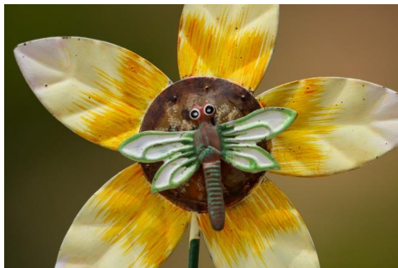
EOS 60D APS-C (1.6x)

All images below captured with exact same camera settings and with the zoom at 300mm, 1.2m distance to subject.