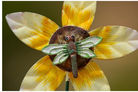
Canon EOS 60D, 300mm zoom setting

Another typical use for this lens by the amateur or enthusiast photographer will be wildlife when taking the family to a nature reserve. The Zebra again demonstrated the zooming in power of this lens, when used as a test subject from the same position inside my vehicle.