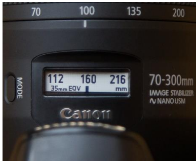
Focal length mode