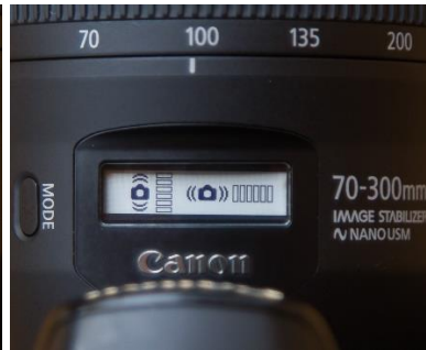
Camera shake mode