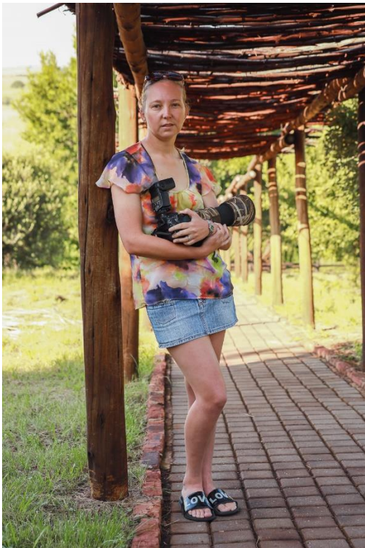
Canon EOS R, 70mm zoom

One can expect more than acceptable results using the lens for the typical family portrait sessions, yielding sharp results with very good detail, colour tones and textures. The zoom range is ideal for the enthusiast family photographer, zooming out for loosely framed full body or group images and zooming in to capture sharp head and shoulder images. The portrait images below were captured from the same spot, the framing effect is due to lens zoom only.