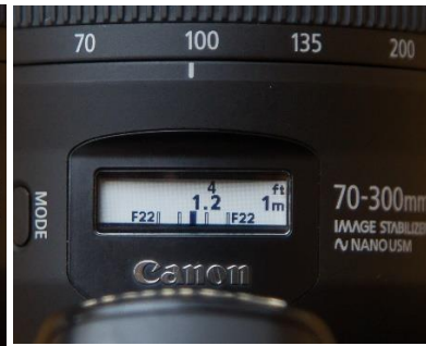
Distance scale mode