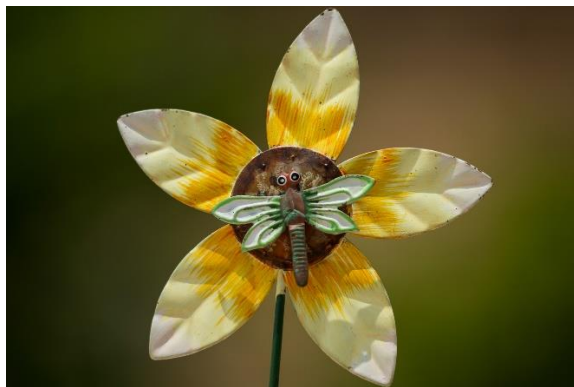
EOS 1Dx Full Frame