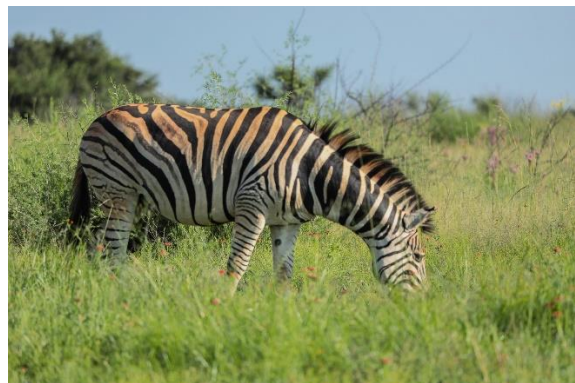
Canon EOS R, 300mm zoom setting

Testing for light fall-off and vignette was done using the EOS R and sample frames were captured at 70mm f4 and f8 and at 300mm f5,6 and f8, then repeated with the lens hood fitted. First of all, the lens hood didn't have any noticeable effect on light fall-off and didn't cause any vignette. The corners and extreme edges of the frames captured at 70mm f4 and 300mm f5.6 showed visible light fall-off, which was virtually gone at f8. Not measured scientifically, but about 1/3 stop light fall-off was noticed.