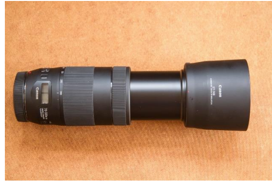
Length at 300mm

The optional lens hood is the ET 74B model featuring a bayonet style mount with a locking clip which holds it securely in place.