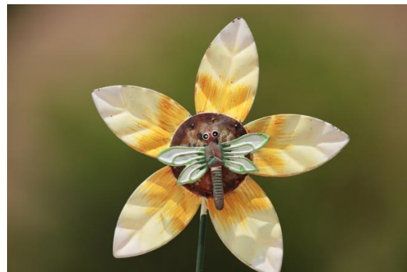
EOS R Full Frame

Viewing the metal flower images at full size shows good centre sharpness even wide open at f5.6, going very slightly sharper when using f8. The edges and corners show a little softening but less than what other similar lenses in this class do. Some purple fringing is noticeable in contrasting lighting conditions, but easily corrected in software. Again, this is less than what can usually be expected from entry and midrange tele-zoom lenses of similar nature.