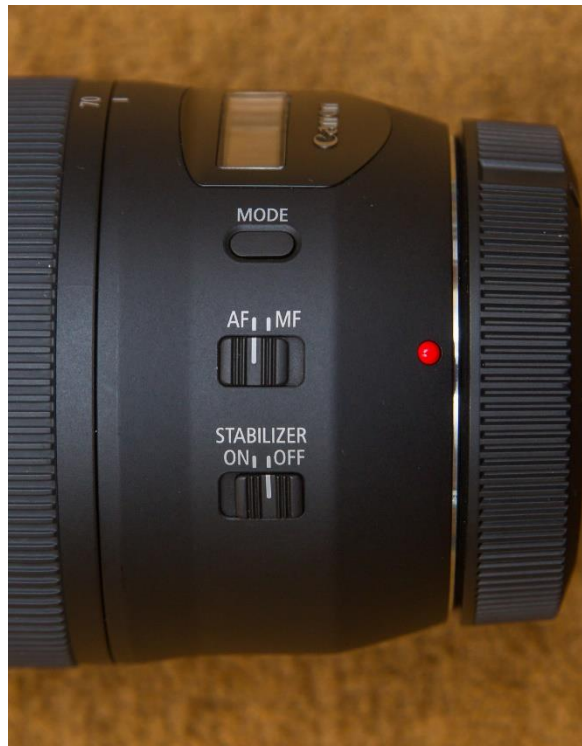
Selector switch layout on the left side of lens barrel

The lens mount is the standard EF design, which means it can be used on both full frame and EF-S mount (1.6x crop bodies) as well as RF (mirrorless mount) when the RF-EF mount adaptor is used.