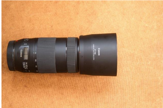
Length at 70mm

The lens extends when zooming, as do all the lenses in this zoom range and price bracket.