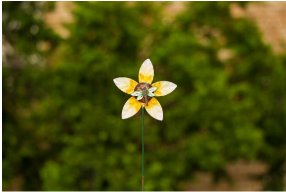
Canon EOS 60D, 70mm zoom setting